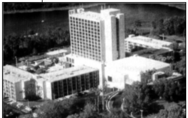
Its unique combination of lush surroundings, elegant accommodations, and location in Downtown Disney make the Grosvenor Resort a favorite meeting spot with executives.

This newsletter is published by Southeastern Fisheries Association. Please pass it along and encourage others to be added to our mailing list. If you want to be removed from the list, please contact us.